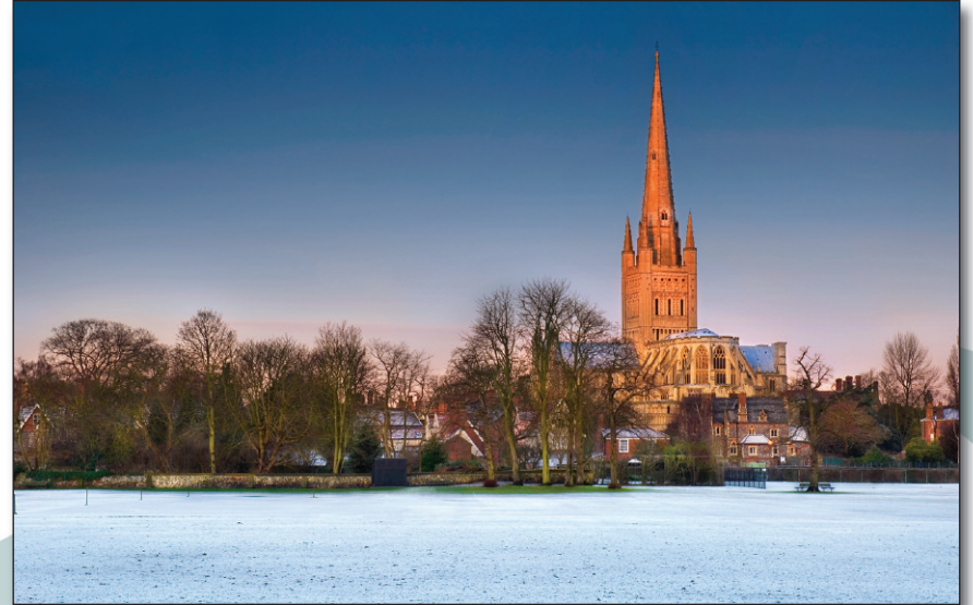
Norwich Cathedral on a cold morning after snowfall.