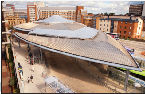
Norwich Bus Station on Surrey Street is a 5 million pound development built in 2005 to replace the old station.