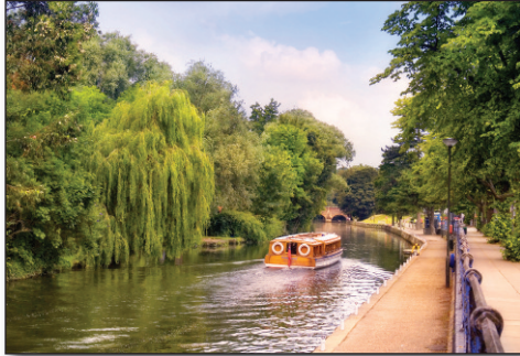
A short walk from the railway station brings you to the River Wensum that meanders around the north and east sides of the city centre.