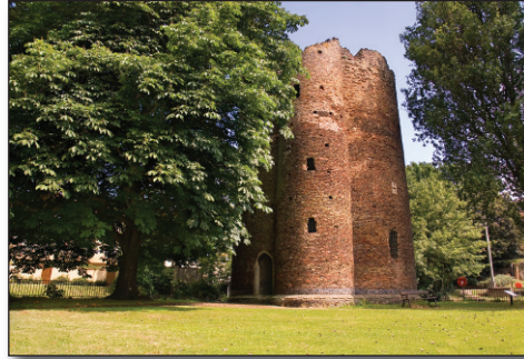
Cow Tower next to the River Wensum is a symbolic reminder of Norwich's medieval past.