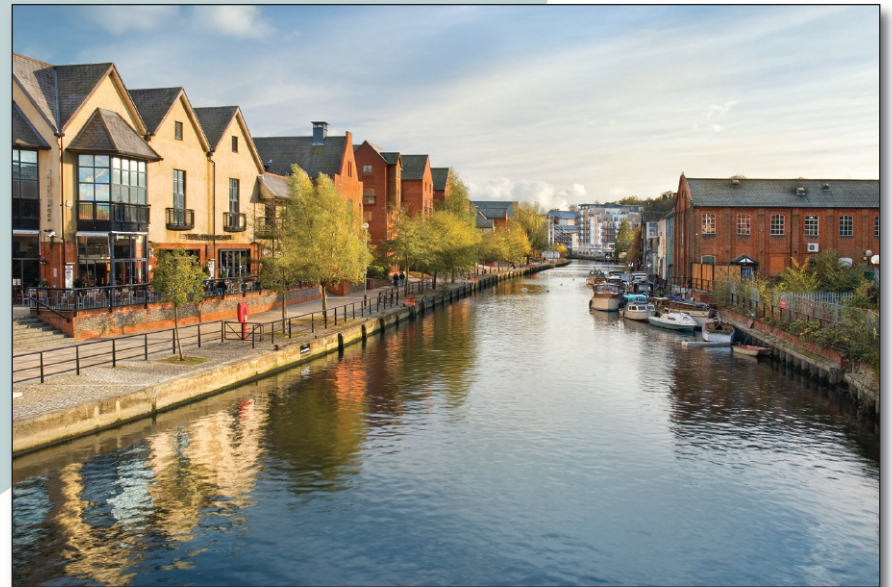
The view from Lady Julian Bridge, looking towards the Novi Sad Friendship Bridge.