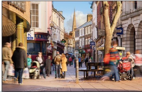
Busy shoppers in the historic London Street.